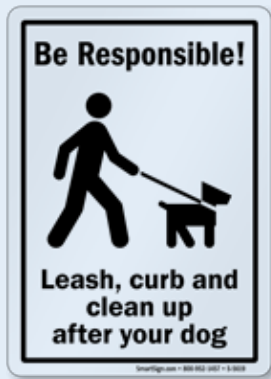
Leash and Curb Your Dog Local Ordinances 129-5, 129-10

Before you know it, the holidays will be upon us. Whether you buy items online or in the store, make sure that you protect your purchases. Items in clear view make easy targets for thieves, so don't leave unattended packages on porches or in vehicles.