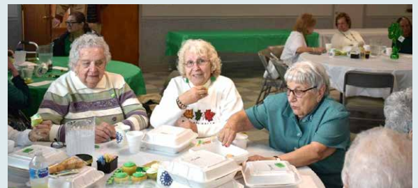
We had a great time at our St. Patty's Day Celebration in March!